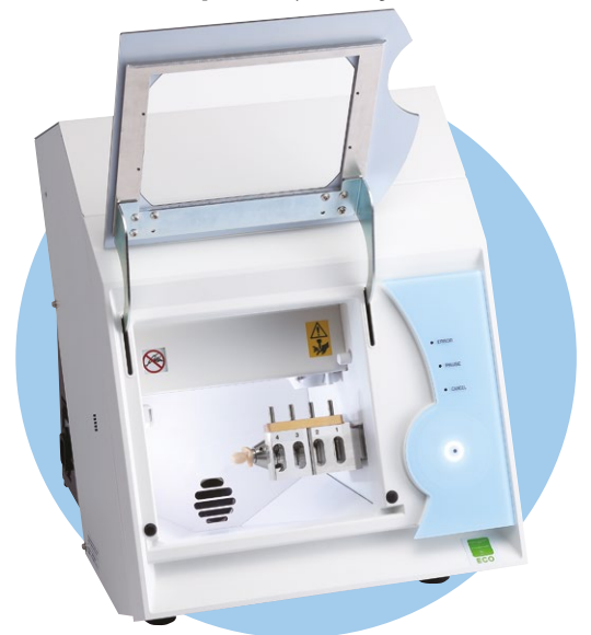
DWX-4 shown with optional 4 bay tool charger.

The DWX-4 is equipped with an integrated air blower that prevents excessive dust buildup and a negative ion generator that neutralises static electricity when milling PMMA. Adding to peace of mind, the DWX-4 can be connected to your chosen dust collection system and sensor that prevents the machine from starting if the vacuum is inadvertently left off.